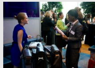
viewing knomo's pop-up shop