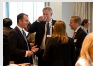
Some of the "Suits" in the room.